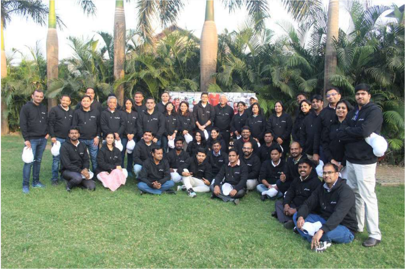
Digital and ER&D Leaders with MD at Team Offsite

Thanks to the all-pervasive changes brought about by digitalization, OEMs must assess their legacy landscape and embrace the tech transformation led by their customers. Software is at the center of this shift in how clients design, manufacture, and sell their products. It has irreversibly altered the technology roadmap for Onward Tech's clients.