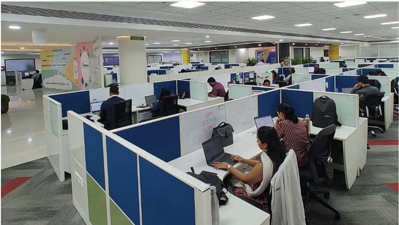
Onward Technologies Offshore Delivery Center, Pune

Despite the economic uncertainty, global ER&D spending will continue to grow at 10% CAGR, says the Bain & Co.’s ER&D Report 2023, attributing a lion’s share of the delta to digital engineering. Among other things, these numbers indicate demand for quality talent to ramp up engineering and digital teams at speed. And this is precisely where we believe a right-sized technology partner like Onward Tech, with its responsive variant of the global delivery model, will continue to grow its market share, exponentially and profitably.